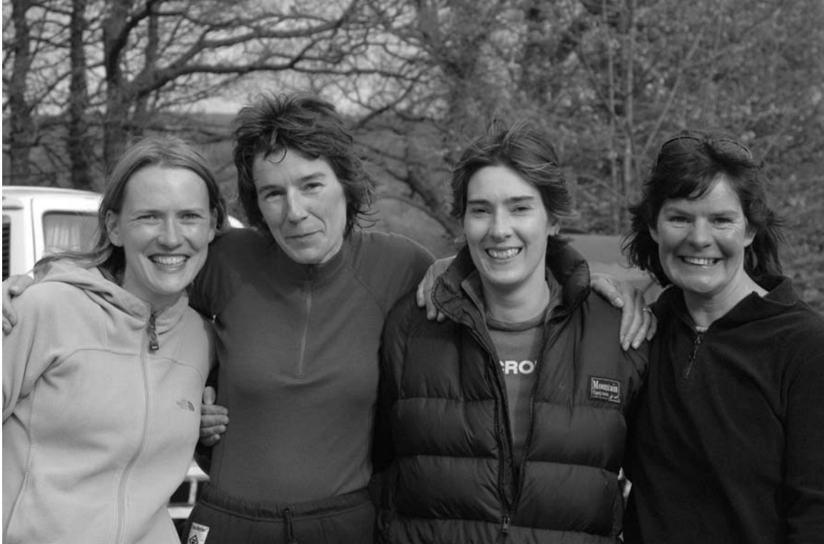
The winning ladies' team at Coniston fell race - yes, it's Tod.